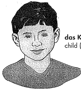
das Kind child (male)