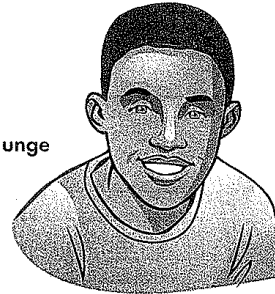
der Junge boy