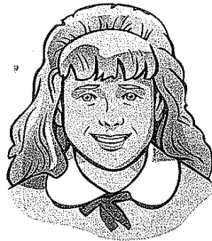
das Kind child (female)