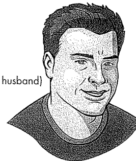
der Mann man (as well as husband)